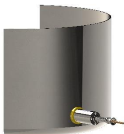
On reactor wall