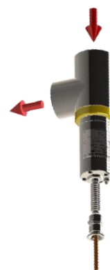
On a bypass loop

Any questions or specific needs regarding other viscosity solutions? Let us help you find the best match for your process by contacting us at: instruments@sofraser.com