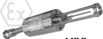
MIVI process viscometer