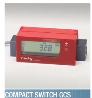
COMPACT SWITCH GCS

A threshold value can be activated for leak detection. The totalling unit permits use as a gas meter.