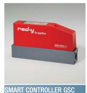
SMART CONTROLLER GSC

These mass flow controllers feature high accuracy and rapid regulation.