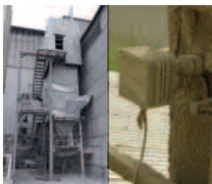
Damp cement mill monitored utilising a fully insulated sensor

Employing probe-based systems can be monitored not only for performance to comply with environmental legislation but by utilising PCME's unique Predict software package, the monitor can be used as a powerful filter maintenance tool. This not only greatly reduces maintenance time and costs but eliminates the dirty and difficult job of identifying row failure by permitting remote identification.