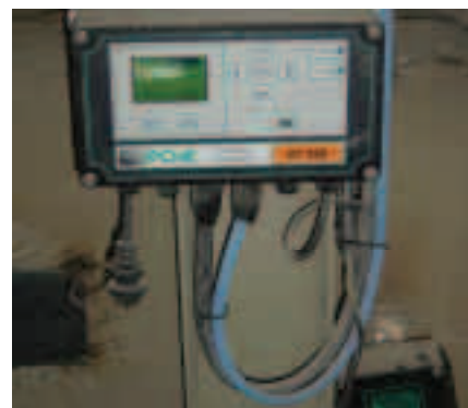
Product loss prevented by silo monitoring

Stacks are not always dry. Many locations have very moist conditions which prevent the use of most technologies. PCME's unique, patented, fully insulated Electrodynamic sensors overcome this problem to provide accurate calibrated data. In some instances, instruments have been continually used in these aggressive applications for over ten years with little or no maintenance.