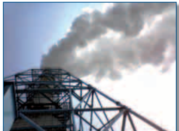
Effective electro-filter monitoring utilising PCME's Optical and Electrodynamic technologies

The ability to observe in real time the performance of the filter allows the operator to adjust operating parameters to optimise not only filter efficiency but also reduce operating costs, extend the filters operating life and decrease the environmental impact of the process.