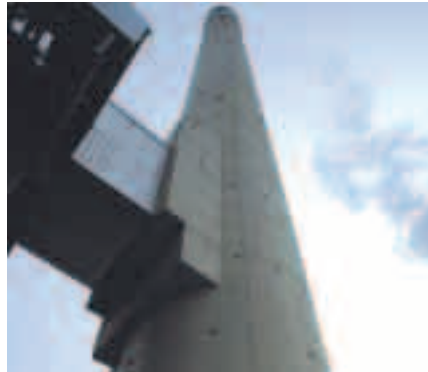
Kiln stack and electro-filter monitored by Dynamic Opacity Instrumentation

Operations such as crushing and milling using filters to prevent dust emissions can be successfully monitored using either simple filter failure devices or advanced calibrateable systems depending on local requirements. Electrodynamic systems are the best suited to monitor these relatively small diameter stacks with low dust loads of typically 5 \text{ mg/m}^3 or less. These systems are virtually maintenance free and do not require additional services such as purge air.