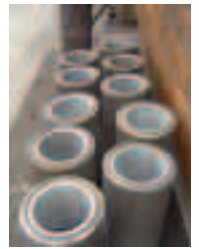
Predict offers the possibility of shorter maintenance times and the replacement of fewer filter elements