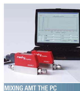
MIXING AMT THE PC

The free 'get red-y' software runs on any PC with a Windows operating system. Synthetic gases can, for instance, easily be prepared in this way.